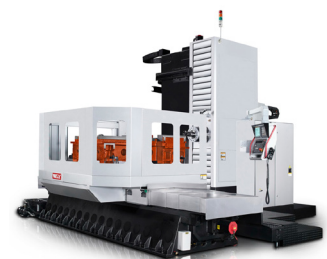
HB1620 Horizontal Boring Mill